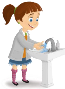
Wash and dry hands