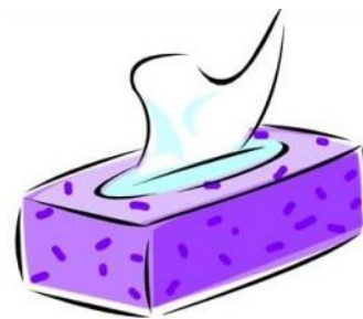
Use a tissue independently