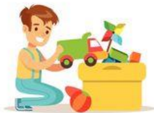
Help to tidy things away