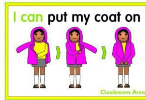
Put on coat and do it up