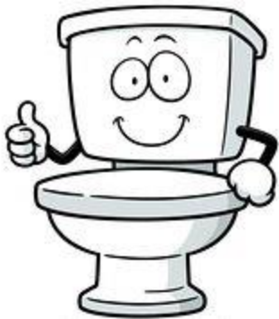
Use the toilet independently