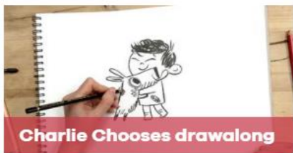
Charlie Chooses drawalong