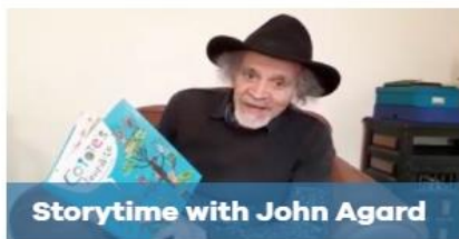
Storytime with John Agard