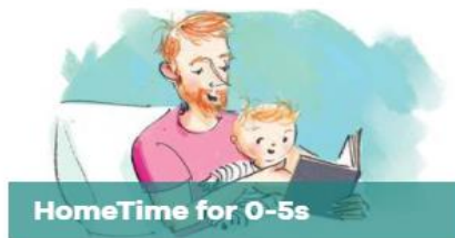
HomeTime for 0-5s