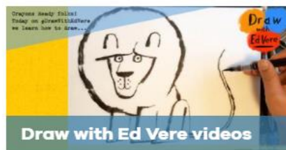
Draw with Ed Vere videos