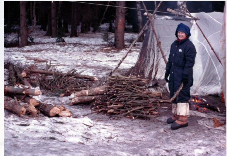
Photo courtesy of Defence Images and bisgovuk (@flickr.com) - granted under creative commons licence— attribution