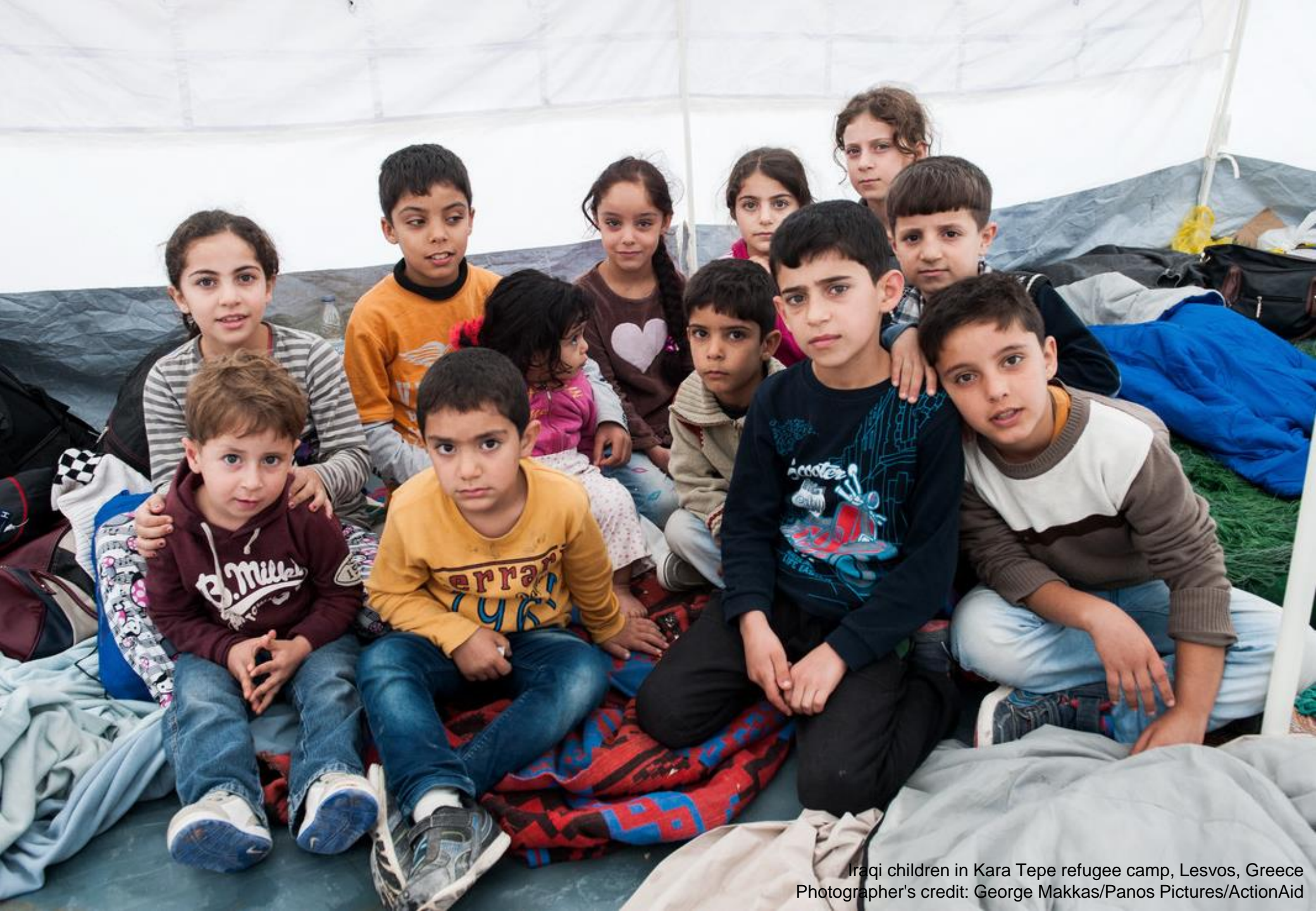
Iraqi children in Kara Tepe refugee camp, Lesvos, Greece