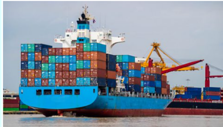
Container ships are used to transport trade goods all around the world.

Today, goods are carried around the world in container ships from port to port and by aeroplane.