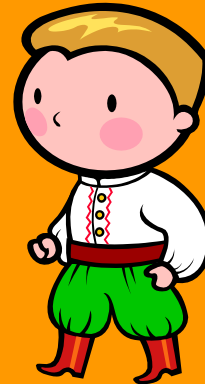
Girls and boys