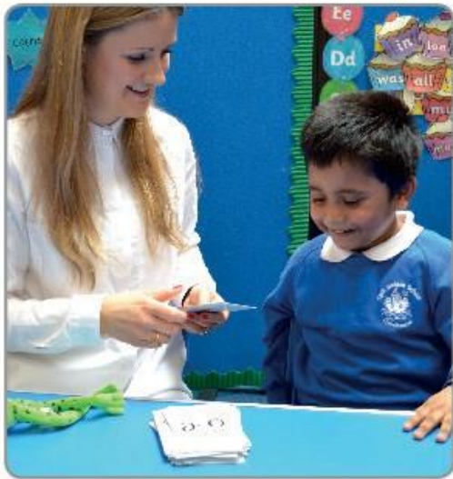
Learning the Speed Sounds in the classroom.